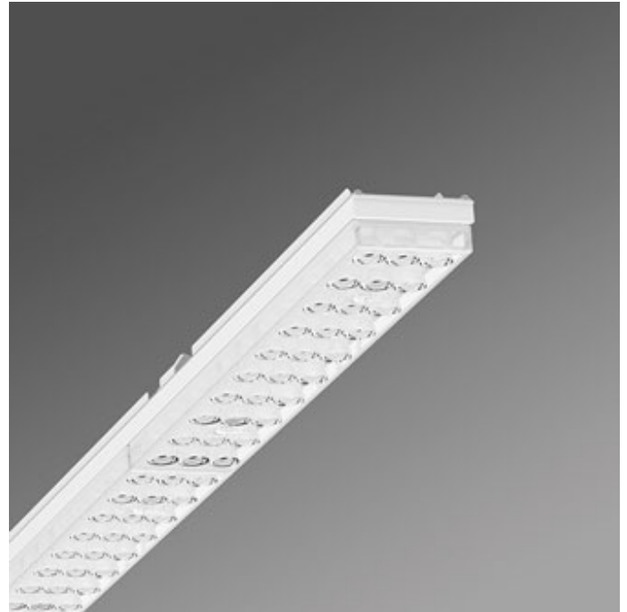
SDGSOT LED 8000lm 840 - vw - DALI - 18620306600

Regiolux GmbH Type: SDGSOT LED 8000 840 DALI vw Article number: 18620306600 Product deep link: http://www.regiolux.de/de/article/18620306600 5 year guarantee after registration on website.