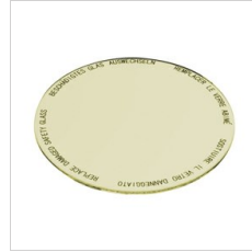
8435963 Food glass filter for fruits and cheese