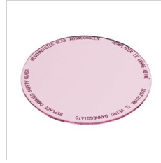
8435961 Food glass filter for meat products