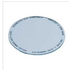
8435965 Food glass filter for fish products