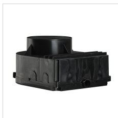
3111136 Recessed fixing kit