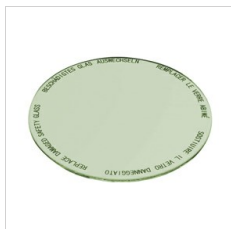
8432964 Food glass filter for vegetables