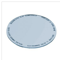
8432965 Food glass filter for fish products