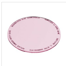
8432961 Food glass filter for meat products