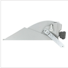
14090394 External cowl in sheet aluminium, provides full cut off with peak beam max 55° and reduces upward light pollution.