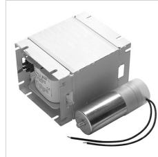
14014420 Set including power supply unit and power-factor capacitor for 2000W HQI- TS 400V 50 Hz lamp