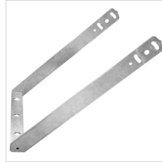
14090202 Long mounting bracket in hot dipped galvanised steel suitable for use when mounting one floodlight above another to avoid interference of light distribution.