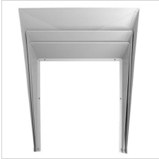
14090594 External cowl in sheet aluminium, provides full cut off with peak beam max 65° and reduces upward light pollution.