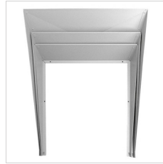
14090494 External cowl in sheet aluminium, provides full cut off with peak beam max 60° and reduces upward light pollution.