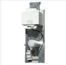
14020601 Power supply unit 400 V - 50 Hz, class I, on galvanised steel plate for 2000W metal halide lamps (not for HQI-TS and HQI-TS High Flux) with fuse and without ignitor