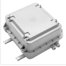
14014394 Aluminium power supply unit IP65, 400 V - 50 Hz, class I, for 2000 W HQI-TS D/S lamps without ignitor