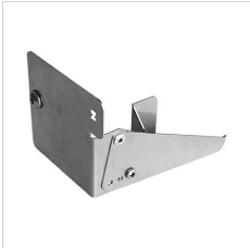
14159204 Horo viewfinder