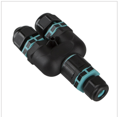
310496 Connection Kit Y 3-way D.7-10.5mm IP68