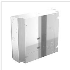
3100883 Recessed box INSERT+3 Stainless steel