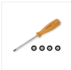
3100992 Stainless steel, anti-tamper locking screws