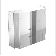
3100883 Recessed box INSERT+3 Stainless steel