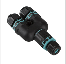
310496 Connection Kit Y 3-way D.7-10.5mm IP68