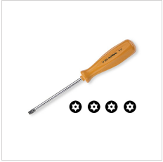
3100992 Stainless steel, anti-tamper locking screws