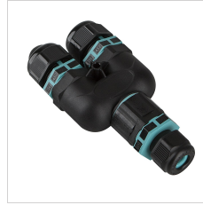
310495 Connection Kit Y 3-way D.14-17mm IP68