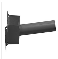
14077796 Hot-dipped galvanized wall angled steel bracket, cataphoresis and polyester powder Anthracite gray