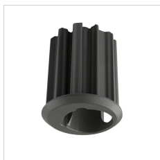
3106386 Reducer pole Ø 42÷46 mm Anthracite gray