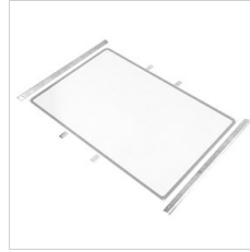
14474494 Protective glass SQUARE PRO (2CH - 3CH)