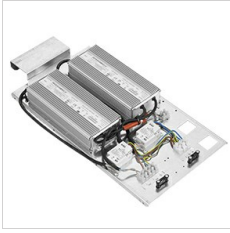
14473401 Drivers unit 600 W - 1,4 A - 2CH - 220- 240 V 50/60 Hz