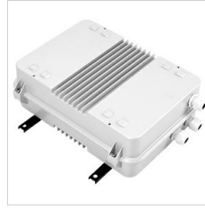
14473894 Drivers box 600 W - 1,4 A - 2CH - 220- 240 V 50/60 Hz Metallic grey