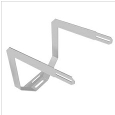
14474594 Vertical bracket SQUARE PRO Metallic grey