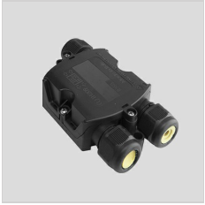
14174220 Connection box IP 66