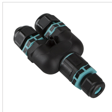
310496 Connection Kit Y 3-way D.7-10.5mm IP68