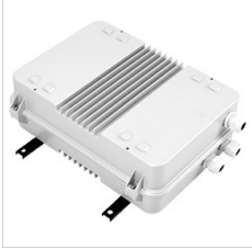
14474194 Drivers box 900 W 1,4A-3CH-DIM DALI