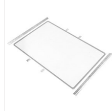
14474494 Protective glass SQUARE PRO (max 840 W)