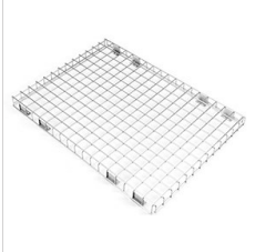
14474201 Protective grid SQUARE PRO