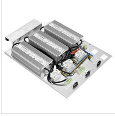
14473601 Drivers unit 900 W - 1,4 A - 3CH - 220-240 V 50/60 Hz