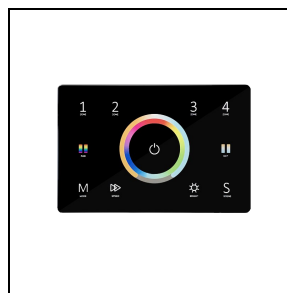
3117845 Controller DMX touch black BK-81 / Black