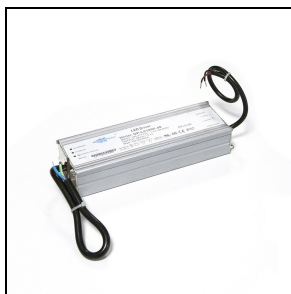
310950 Driver - CV 100 W - 48 V kit