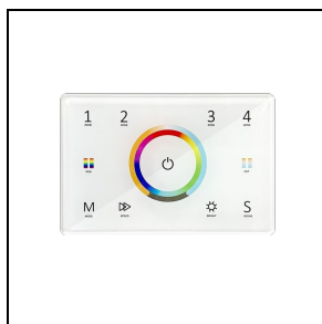
3117844 Controller DMX touch white WH-87 / White