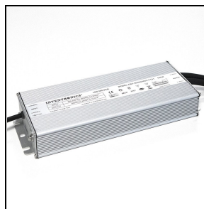
310951 Driver - CV 500 W - 48 V kit