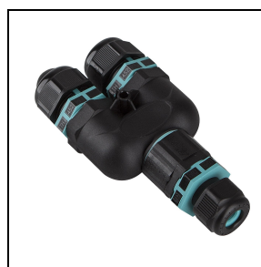
310495 Connection Kit Y 3-way \varnothing 14-17 mm IP68