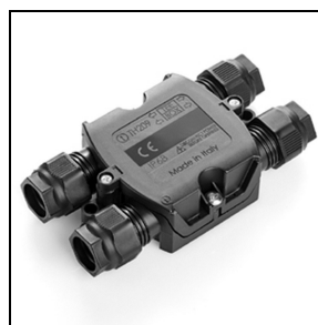
3114174 Connector 4 way IP68